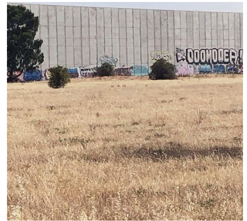
Gillman, November 2024

Our local MPs have organised a community information session - Saturday 15 February 10.30-11.30am Rosewater Bowling Club, 132-134 Grand Junction Rd (entrance via Kelmescott St)