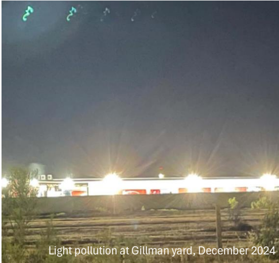
Light pollution at Gillman yard, December 2024