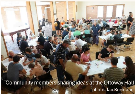
Community members sharing ideas at the Ottoway Hall

From the hundreds of ideas shared at table discussions we have included those that were most frequently mentioned and most directly related to the concept of the Loop as a pathway.